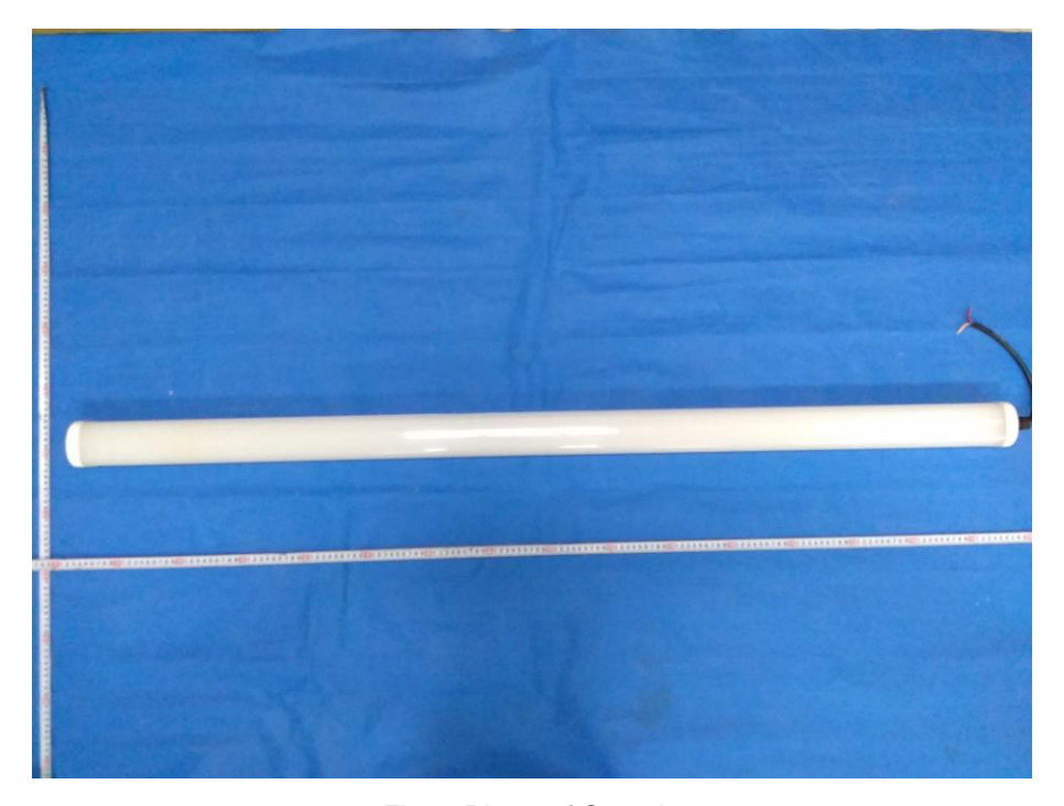
Fig. 1 Photo of Sample